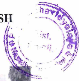
PHOTO PLATES OF NCC EXTENSION ACTIVITY AT ADARSH VIDYAMANDIR, NANGOLE